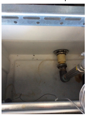
Taken on 01/17/2020 3:53 pm