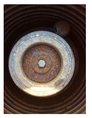
Taken on 01/17/2020 3:50 pm