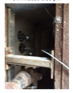
Taken on 01/17/2020 3:53 pm