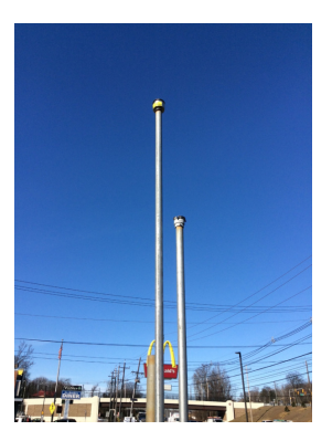
Taken on 01/17/2020 3:52 pm