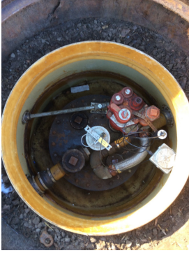
Taken on 01/17/2020 3:52 pm