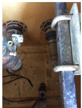
Taken on 01/17/2020 3:53 pm

Is the containment sump free from having any cracks or holes in the sides and bottom?