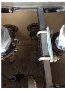
Taken on 01/17/2020 3:53 pm