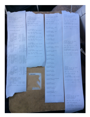
Taken on 01/17/2020 6:43 pm

Comment: Veeder root shows water in T4 Diesel, but the stick tank process shows no water present in