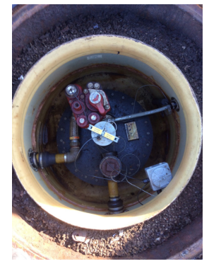
Taken on 01/17/2020 3:52 pm

Is the containment sump free from having any cracks or holes in the sides and bottom?